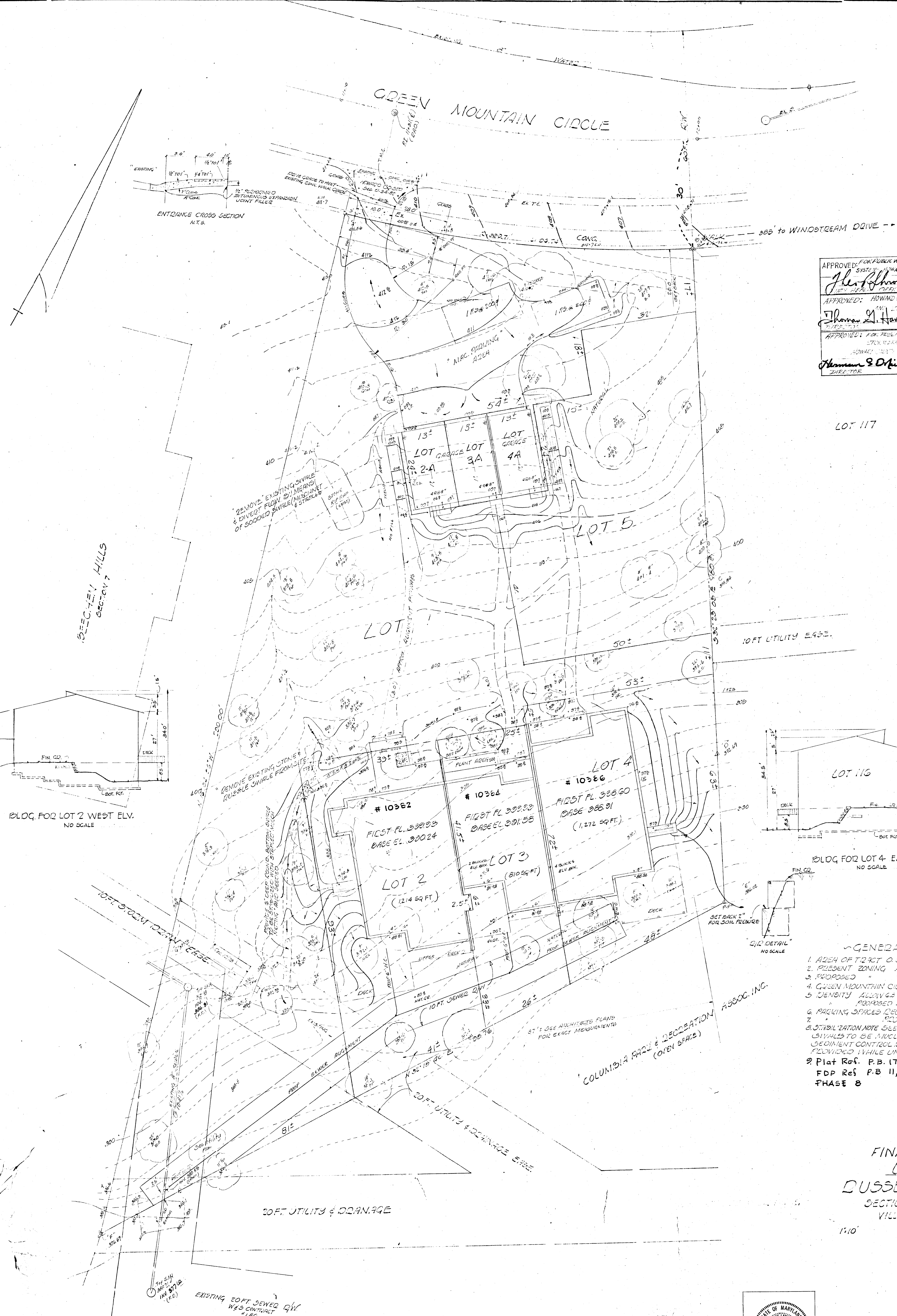
ENTRANCE CROSS SECTION N.T.S.