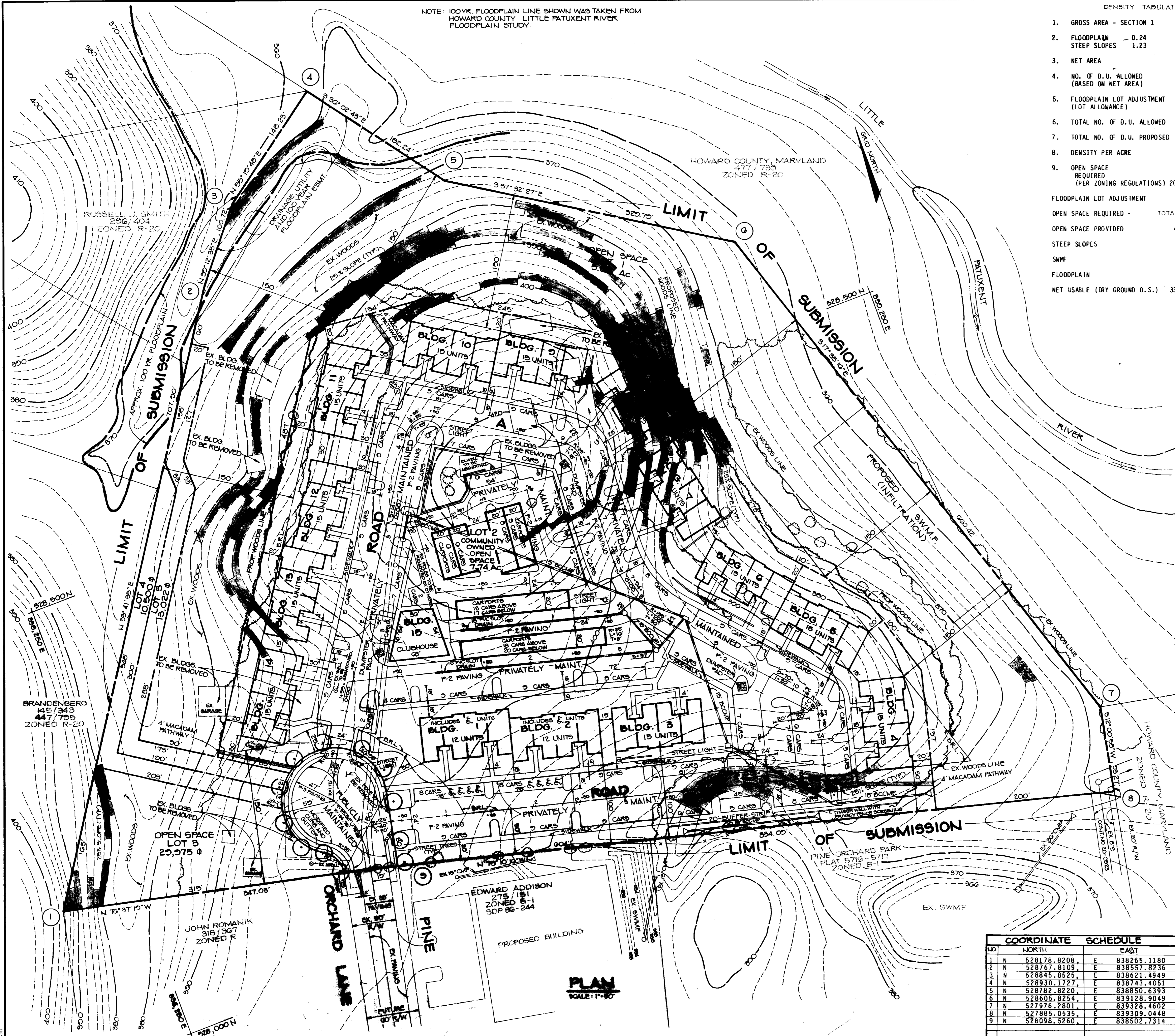
PLAN SCALE: 1" = 50'