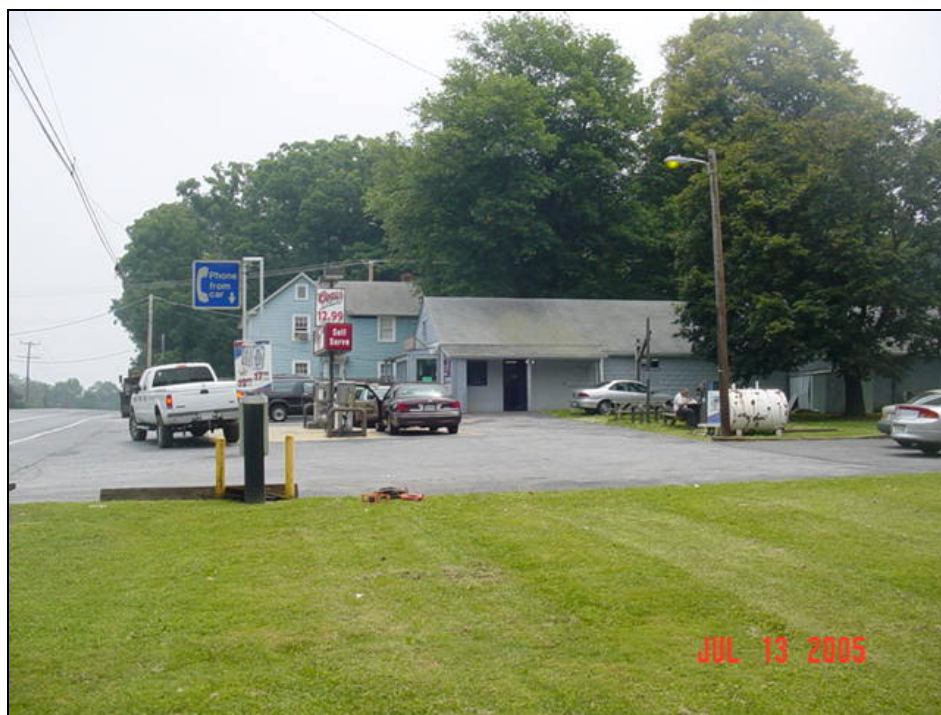
Figure 75 - Impressed Current Rectifier ST11