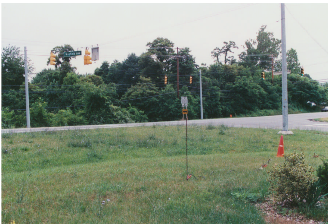
Figure 14. Location of Site 15