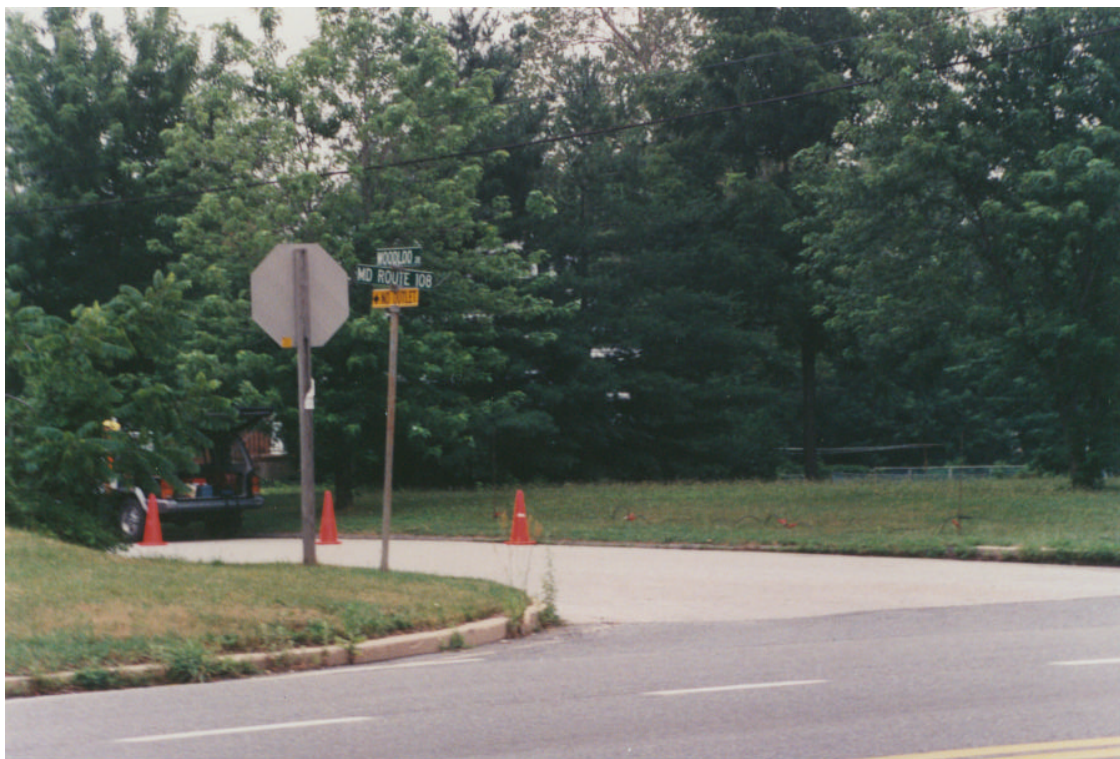
Figure 13. Location of Site 14