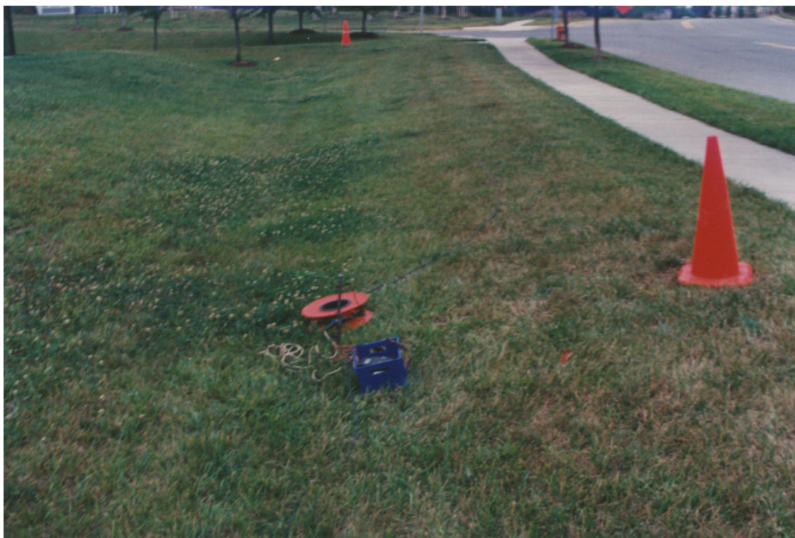
Figure 10. Location of Site 11