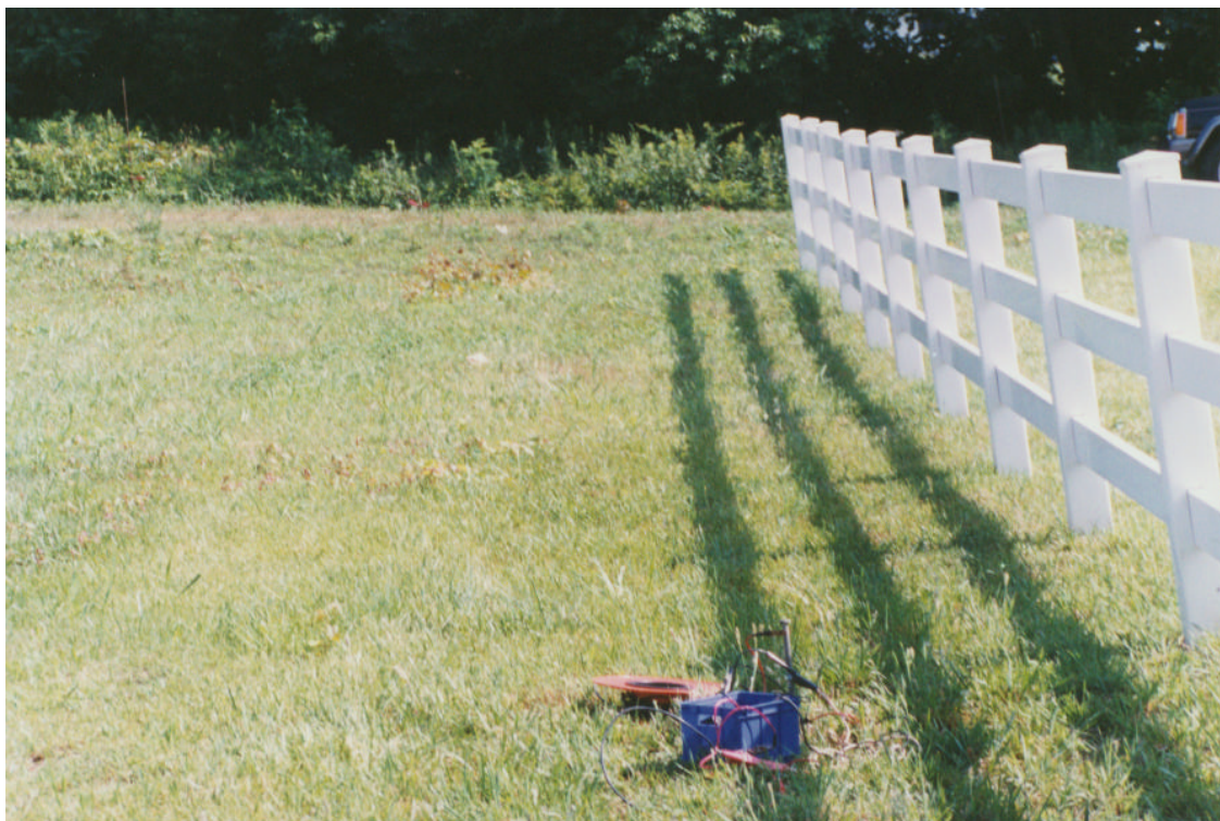
Figure 9. Location of Site 10