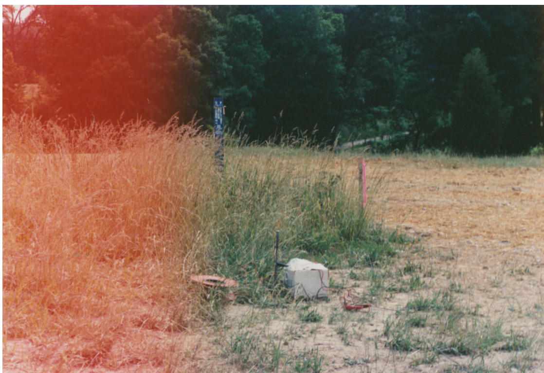
Figure 6. Location of Site 4