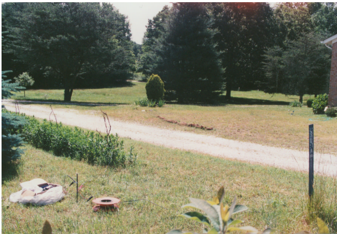
Figure 5. Location of Site 3