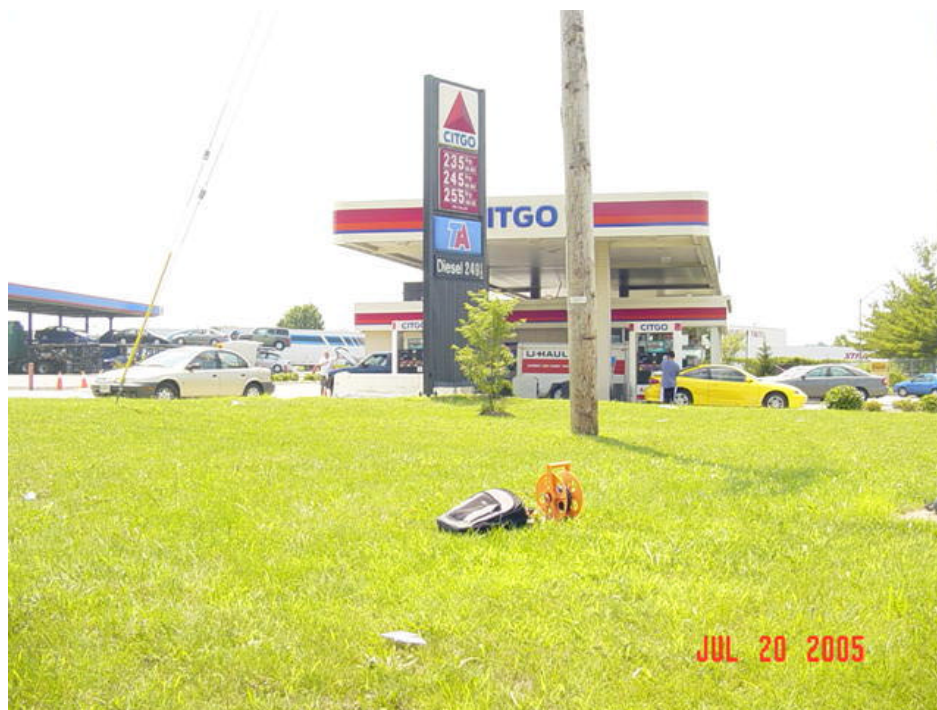
Figure 79 - Impressed Current Rectifier ST13