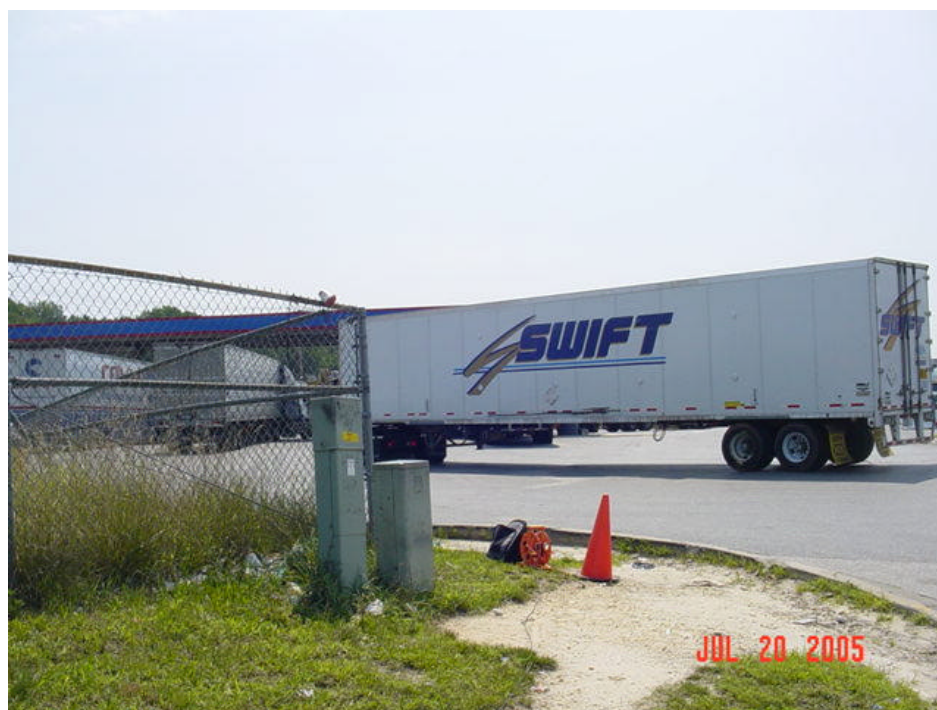
Figure 77 - Impressed Current Rectifier ST12