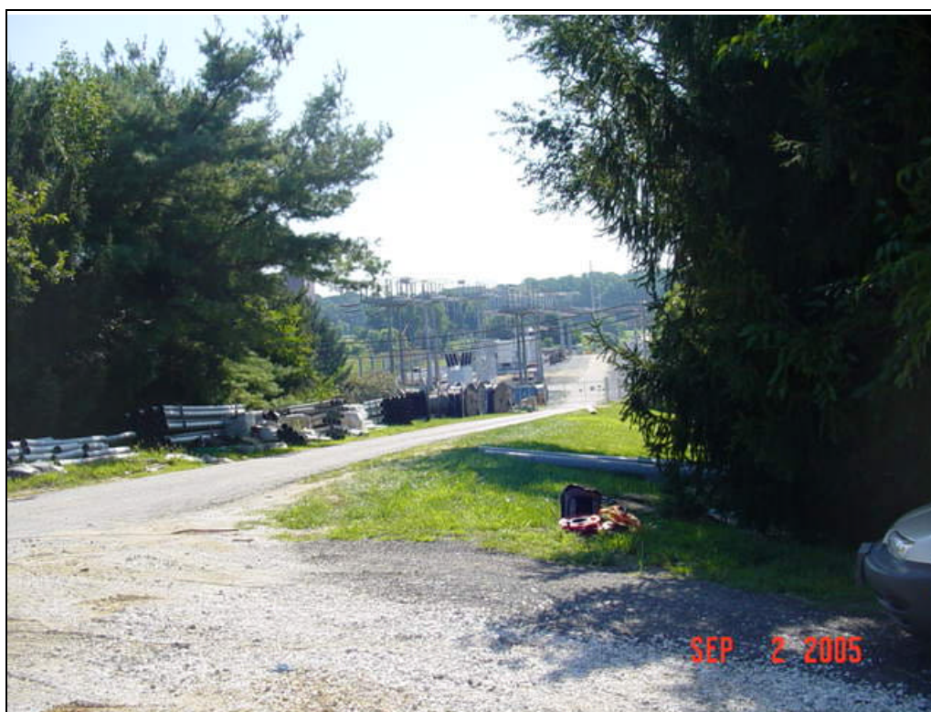
Figure 101 – High Ridge substation