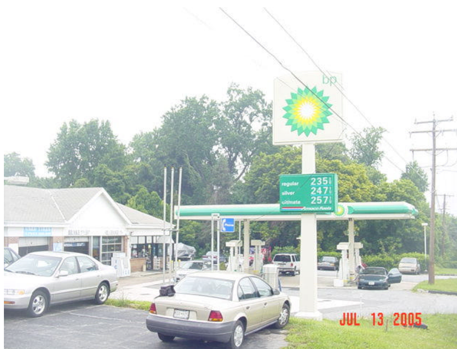
Figure 67 - Impressed Current Rectifier ST7