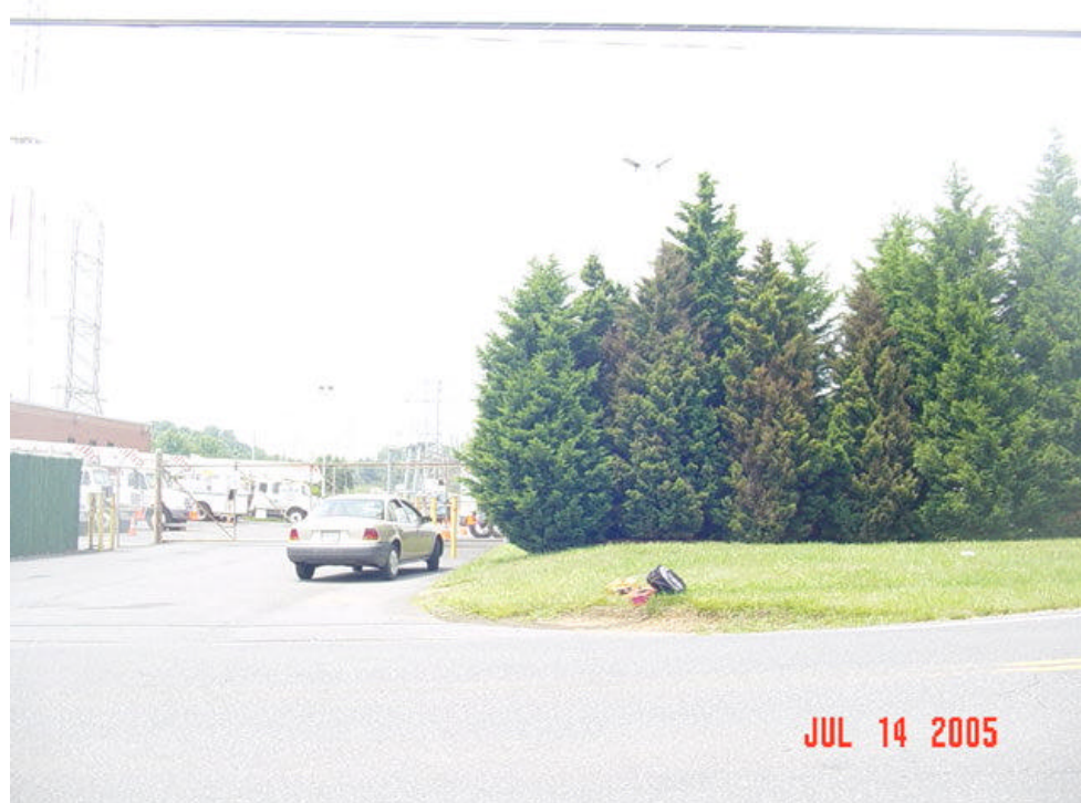
Figure 57 - Impressed Current Rectifier ST2