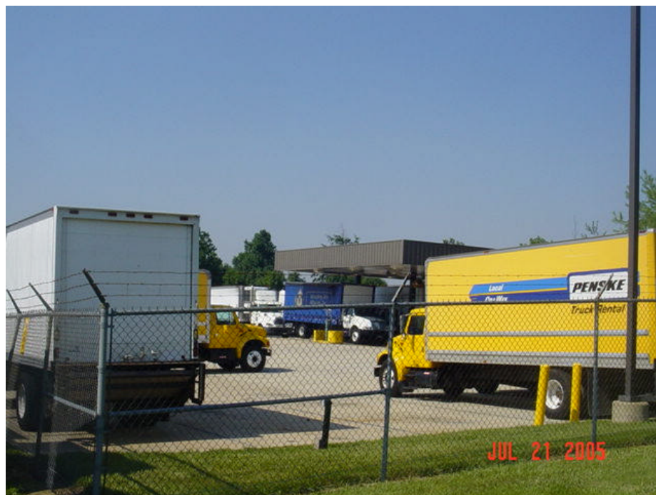
Figure 55 - Impressed Current Rectifier ST1