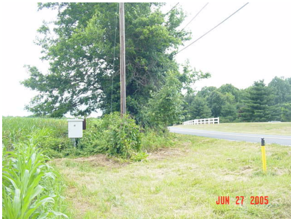
Figure 40 - Impressed Current Rectifier TR4