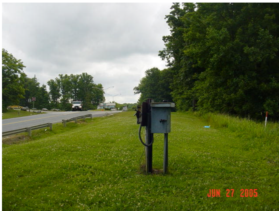
Figure 36 - Impressed Current Rectifier TR2