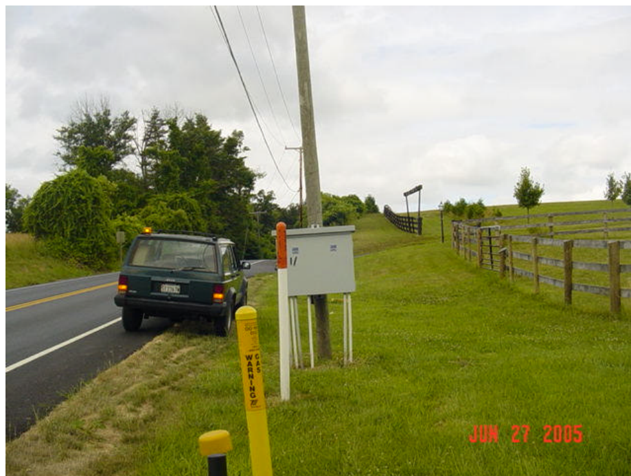
Figure 34 - Impressed Current Rectifier TR1