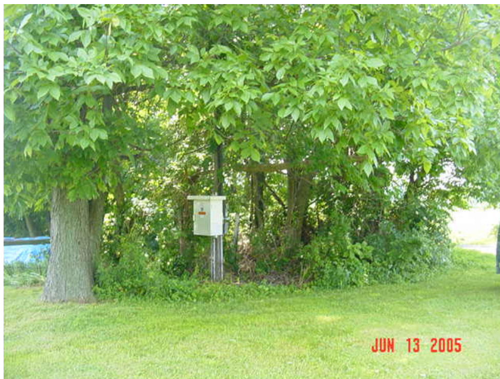
Figure 44 - Impressed Current Rectifier CMB2