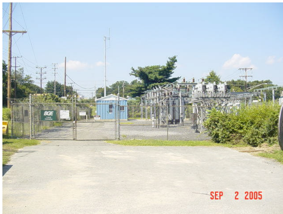
Figure 105 – Laurel substation