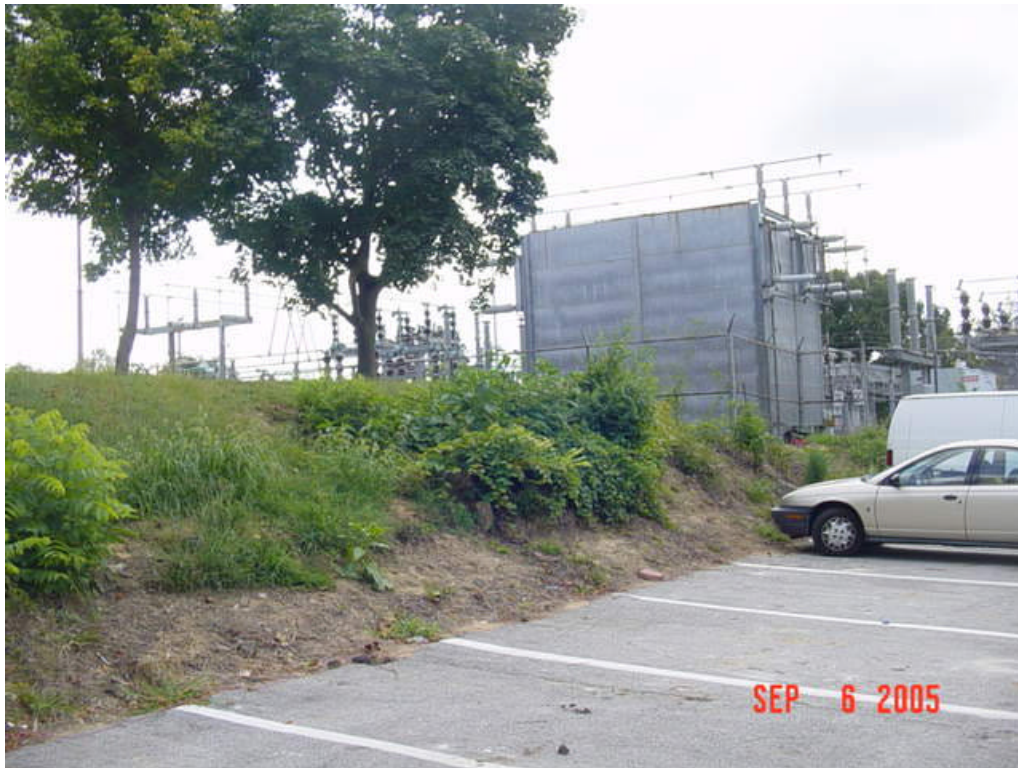
Figure 93 – Dorsey Run substation