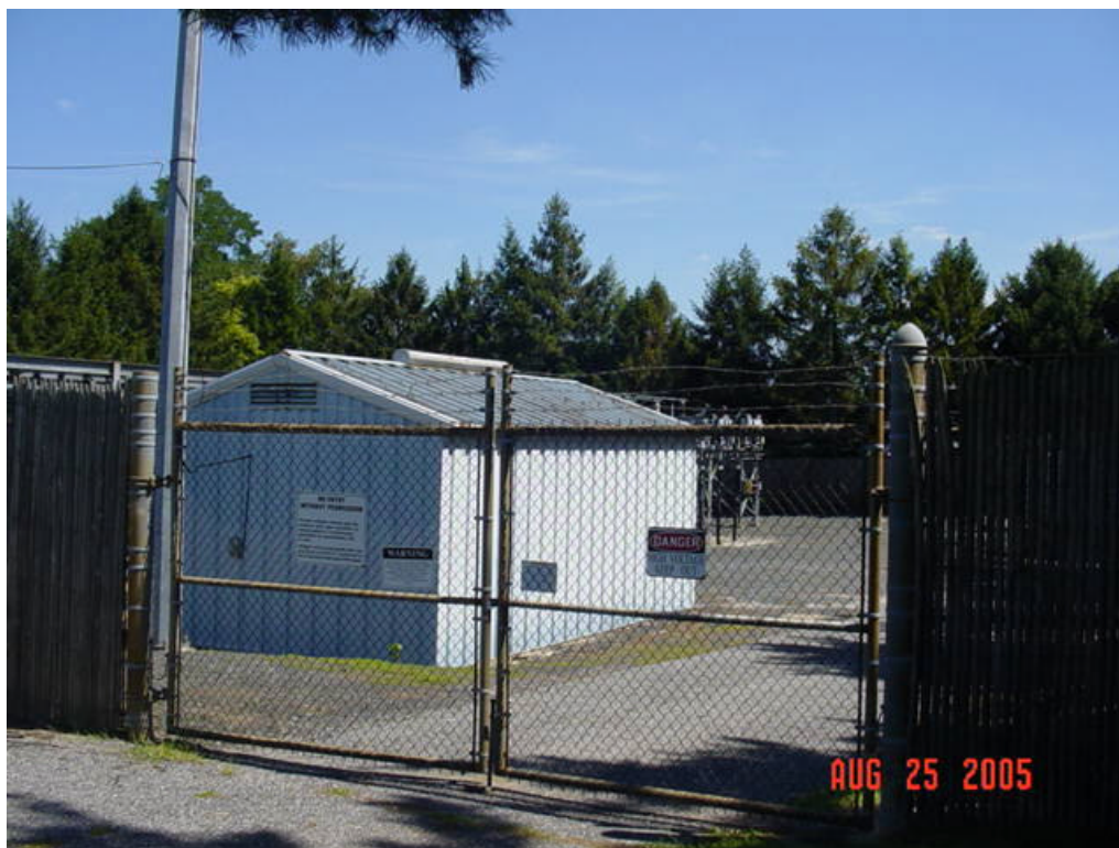
Figure 85 – Bethany substation