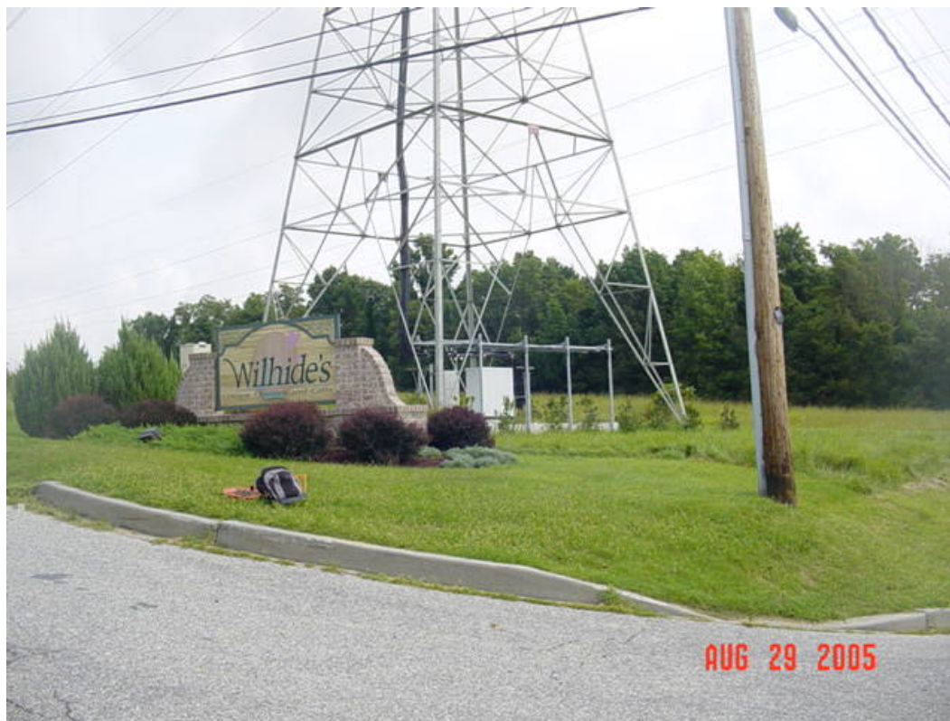
Figure 83 – Autumn Hill substation