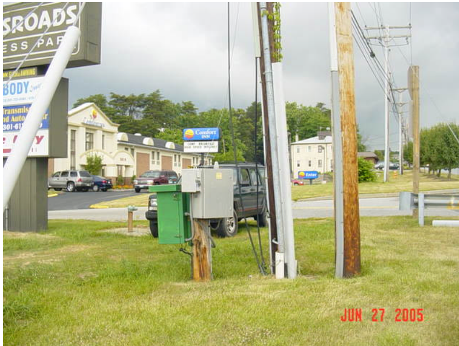
Figure 31 - Impressed Current Rectifier BGE10