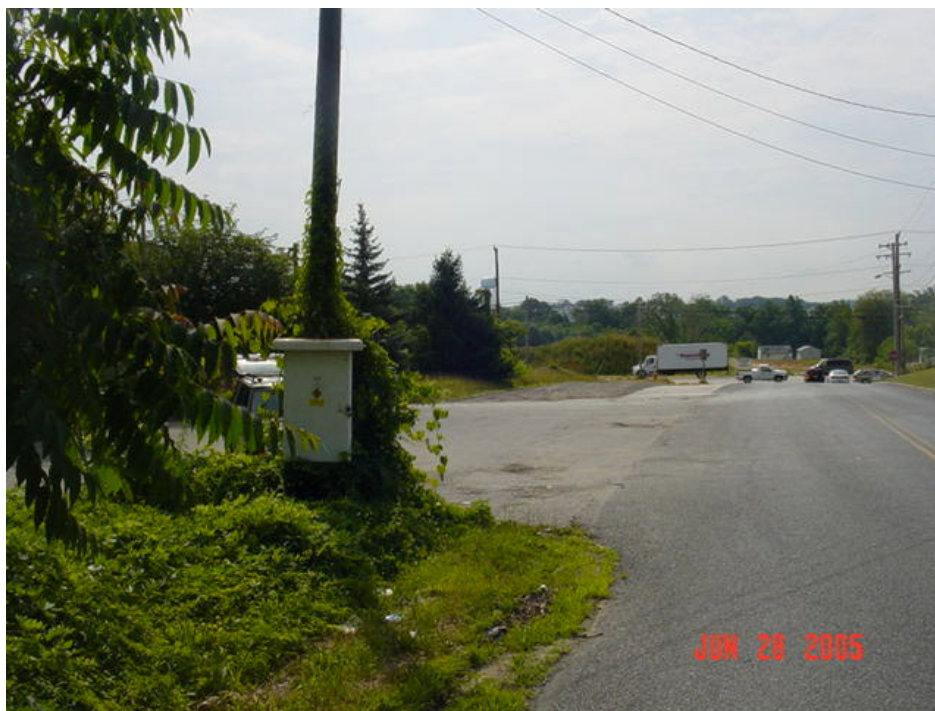
Figure 28 - Impressed Current Rectifier BGE9