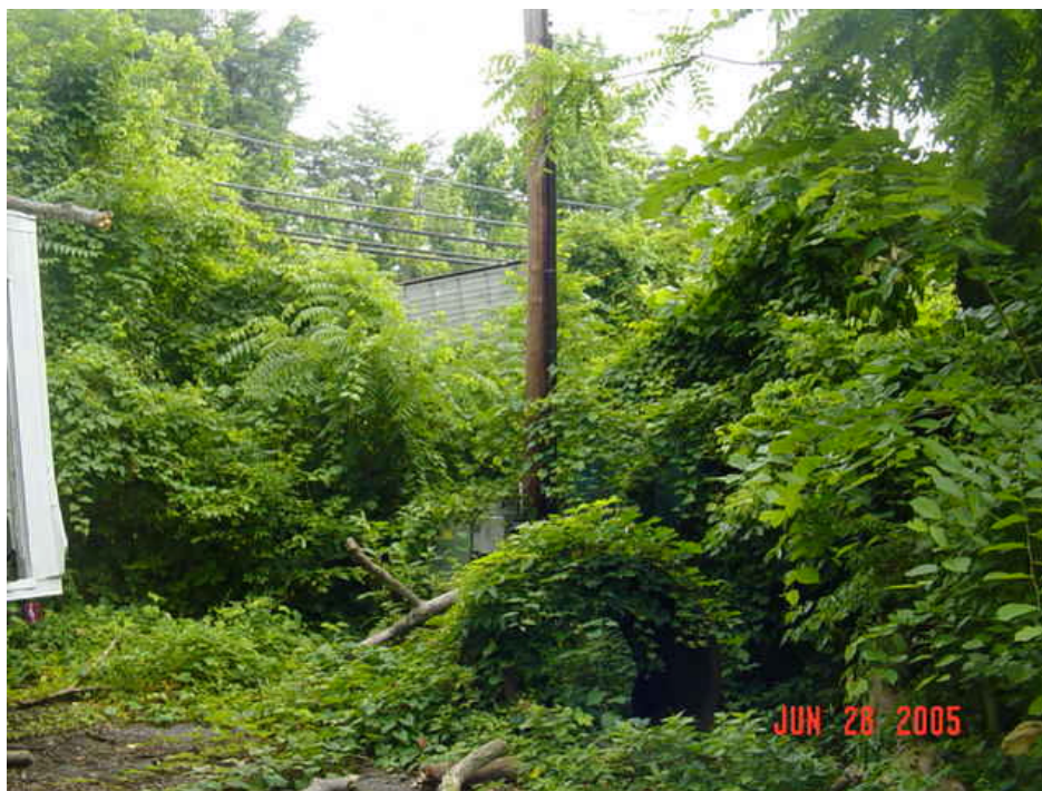
Figure 20 - Impressed Current Rectifier BGE6