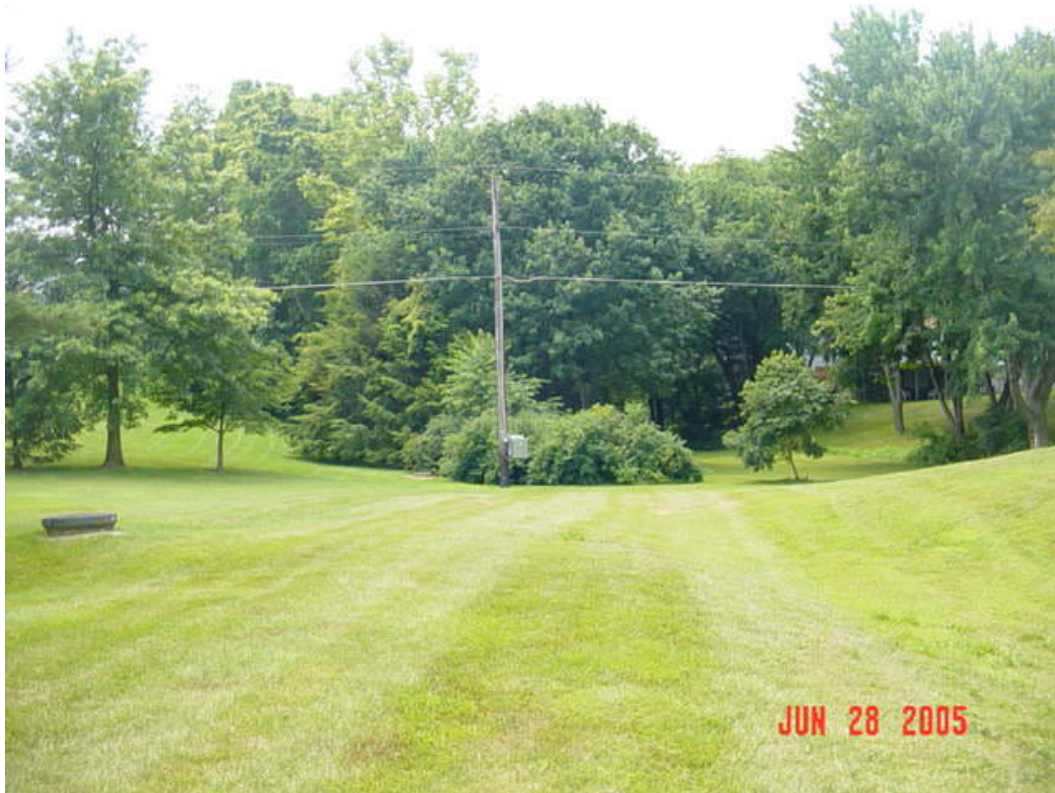
Figure 7 - Impressed Current Rectifier BGE1