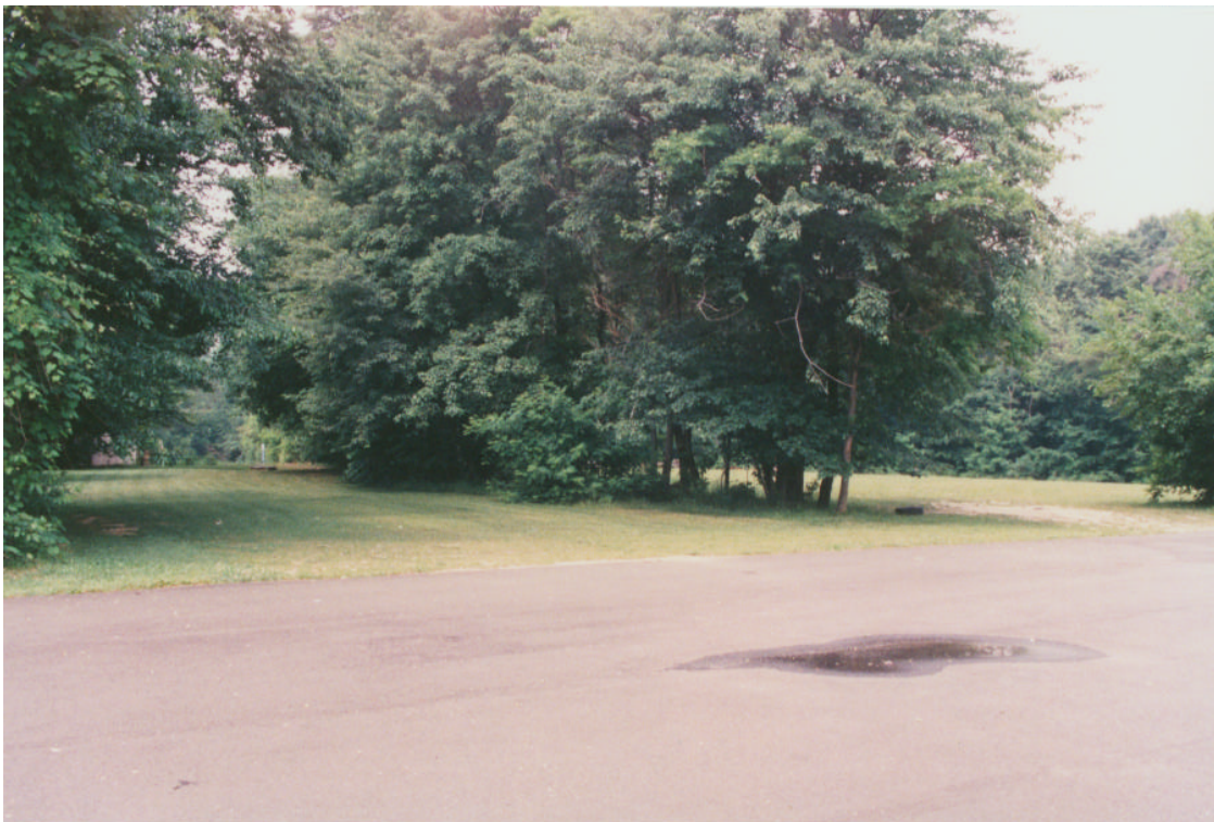
Figure 3. Location of Site 1