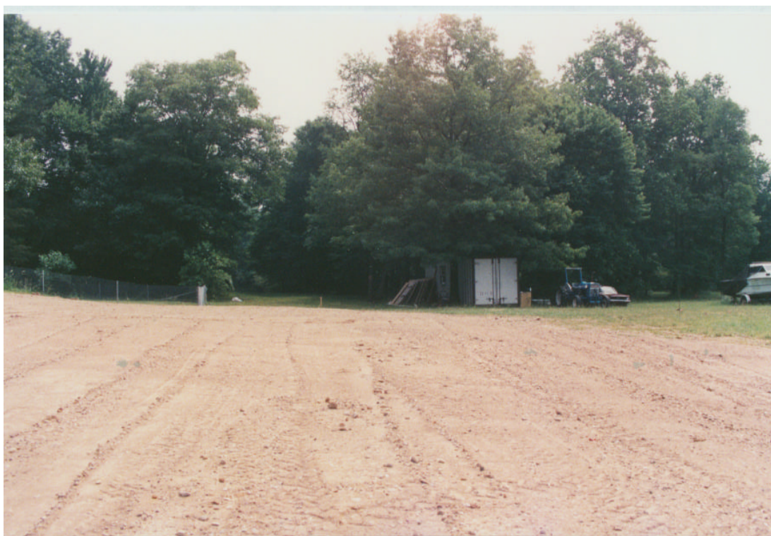
Figure 4. Location of Site 2