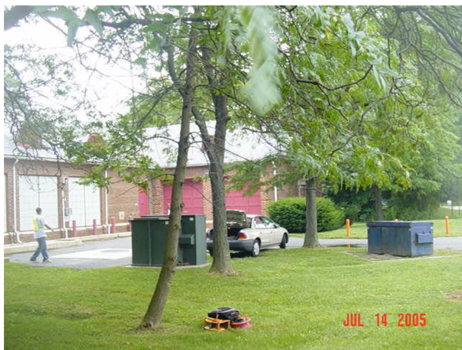
Figure 65 - Impressed Current Rectifier ST6