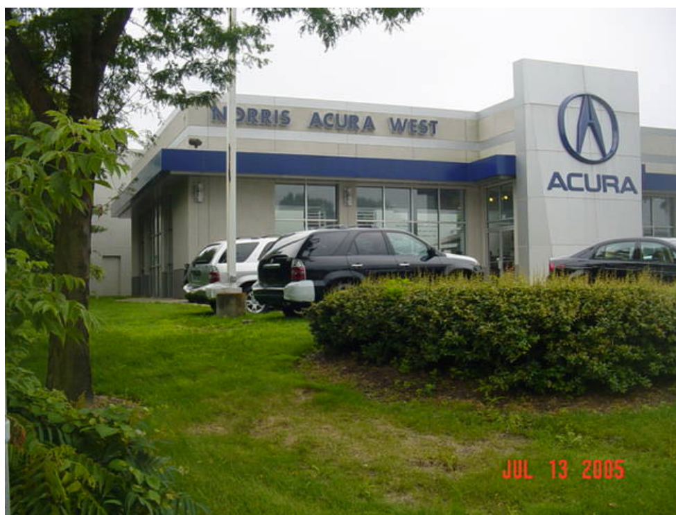
Figure 61 - Impressed Current Rectifier ST4