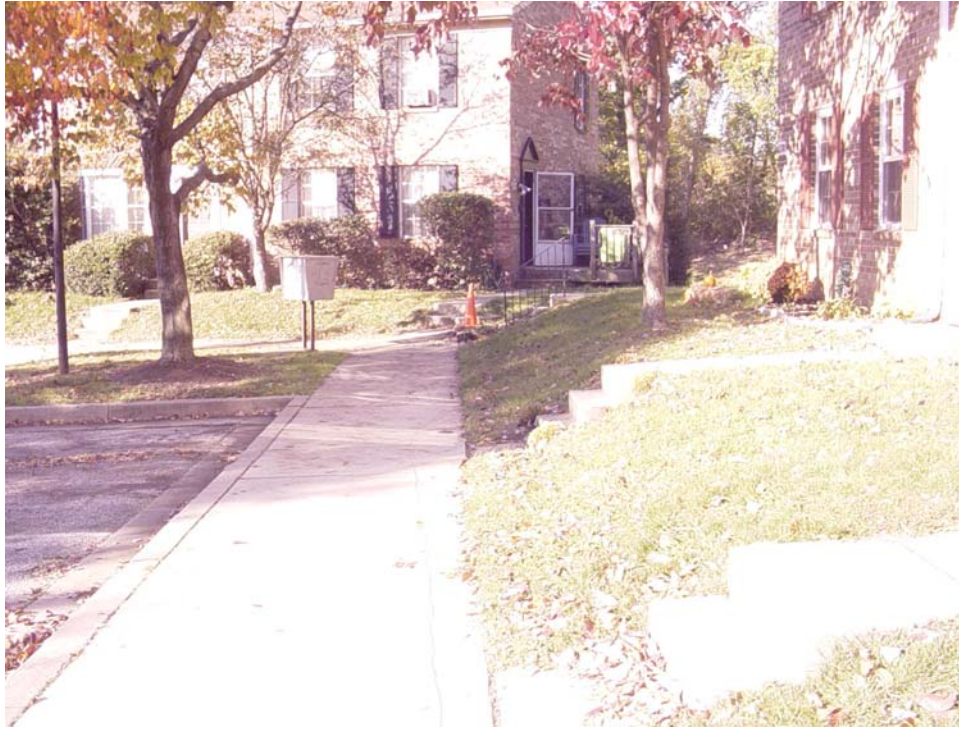
Figure 40 - Stray Current Testing in Marble Hill (Branch D)