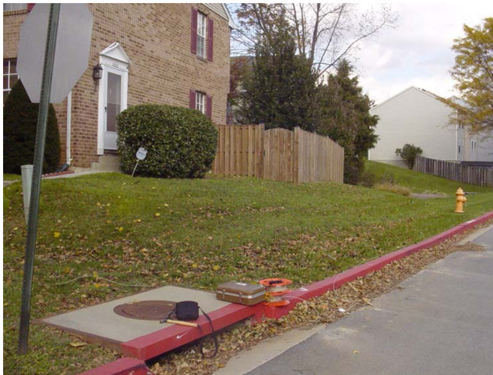
Figure 46 - Stray Current Testing in Marble Hill (Branch B)