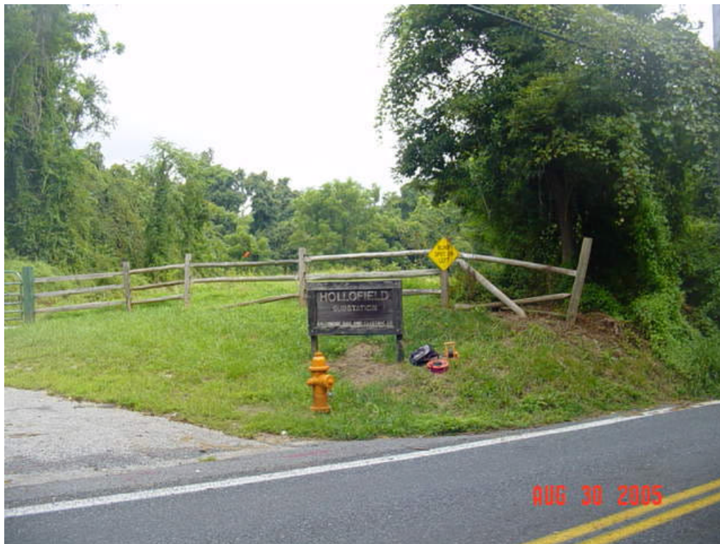
Figure 103 – Hollofield substation