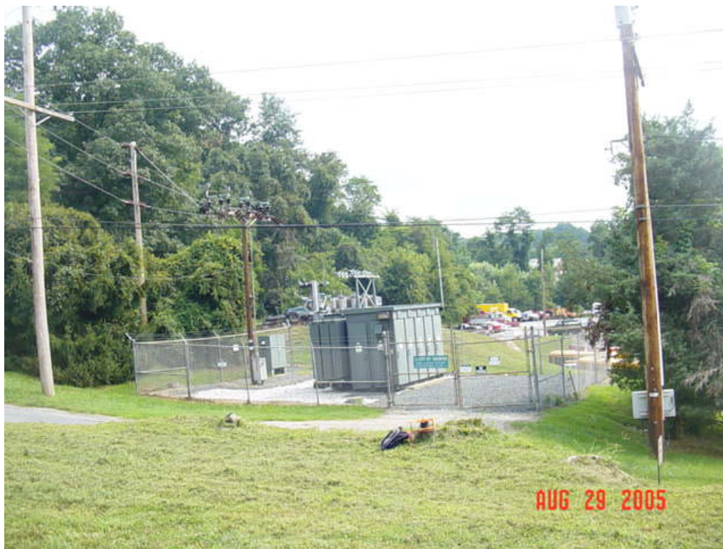
Figure 95 – Ellicott City substation