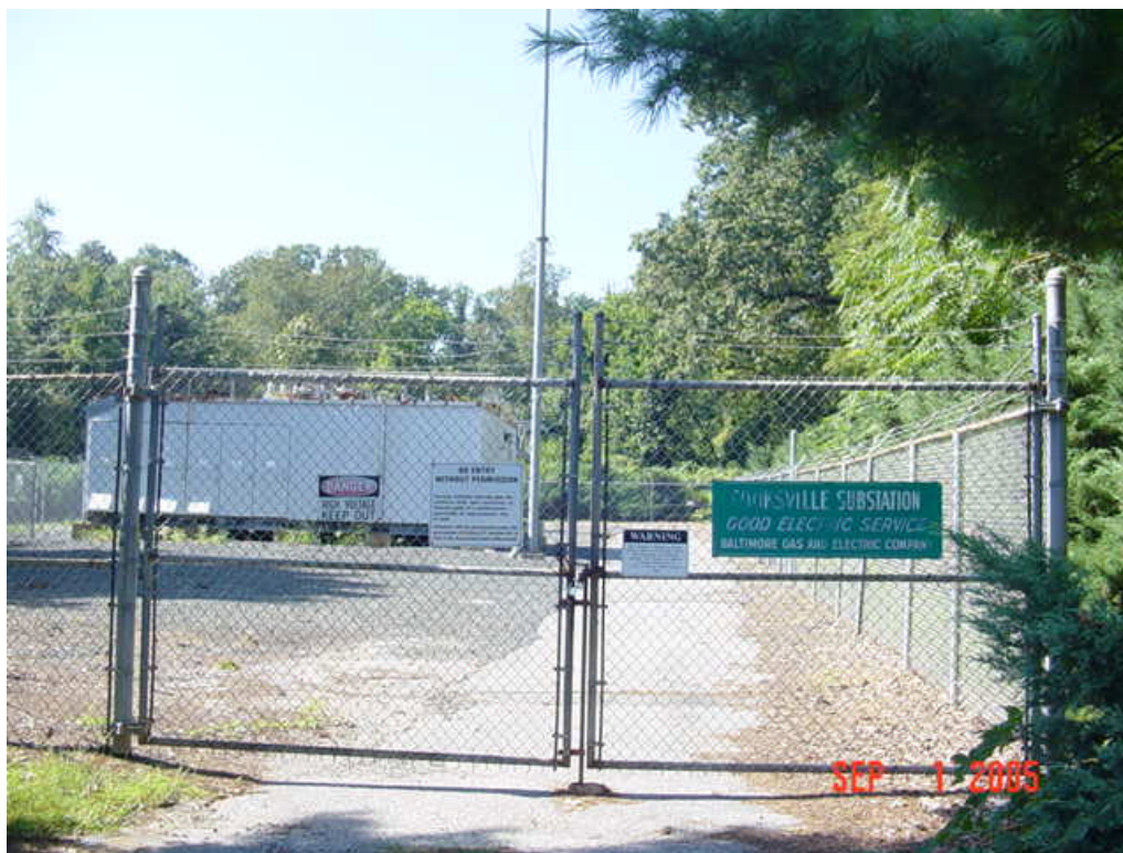
Figure 91 – Cooksville substation