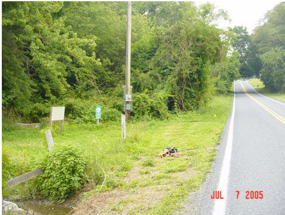
Figure 10 - Impressed Current Rectifier BGE2