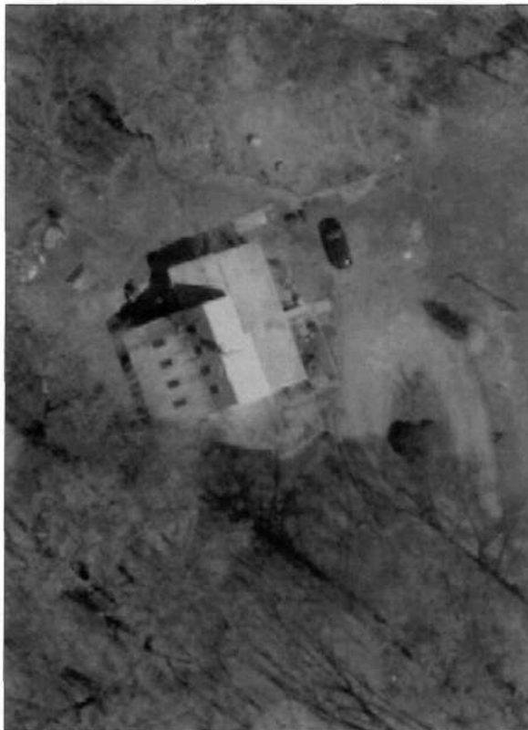
Howard County Tax Maps 32 and 38 (38, p. 545)