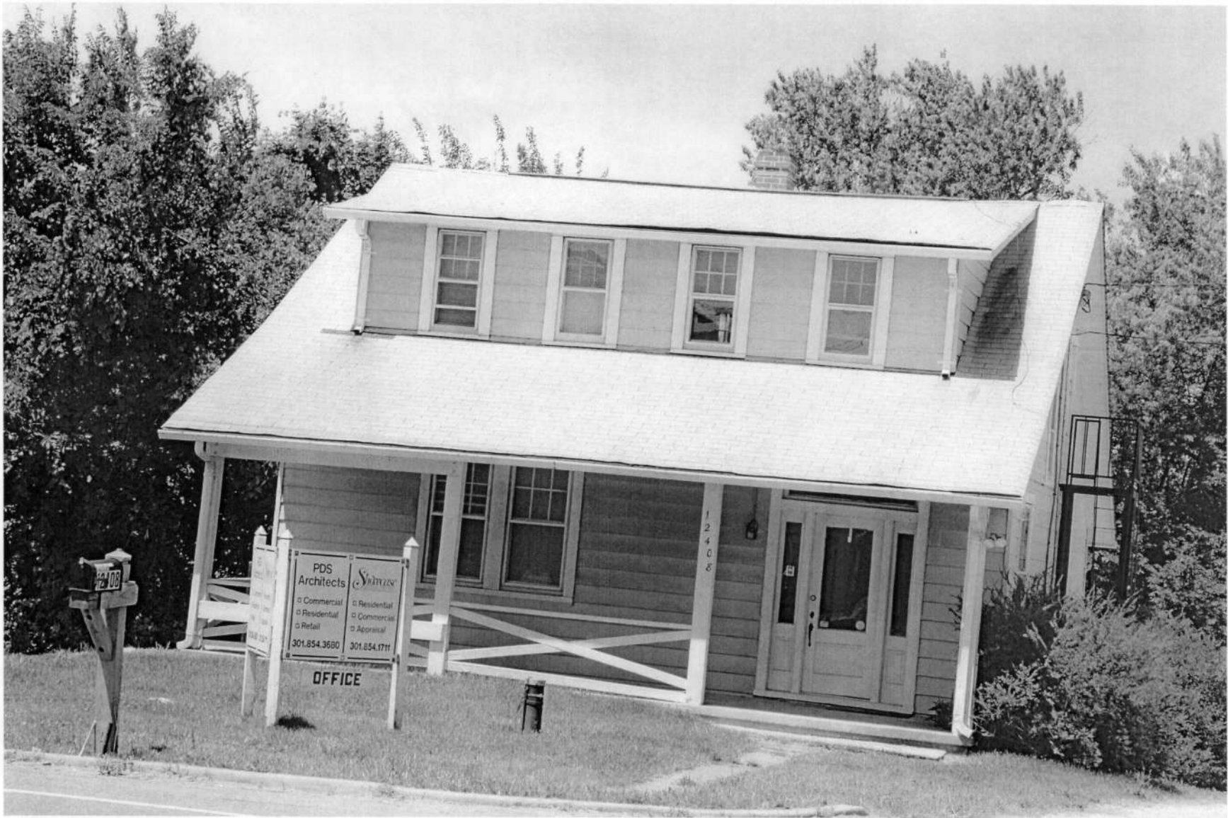
HO-935 12408 Clarksville Pike East elevation 1/1