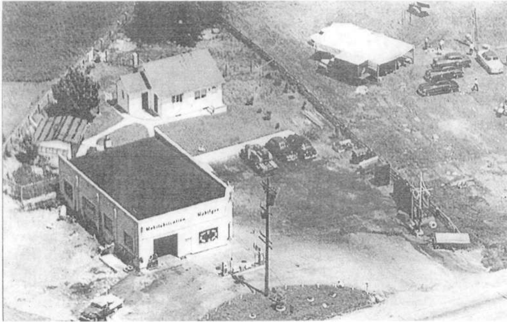
Sause's Service Center and House (HO-888) 8636 Baltimore National Pike, Ellicott City Howard County Historic photo of the property