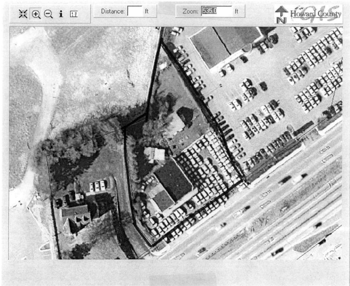
Sause's Service Center and House (HO-888) 8636 Baltimore National Pike, Ellicott City Howard County Site plan/aerial photo