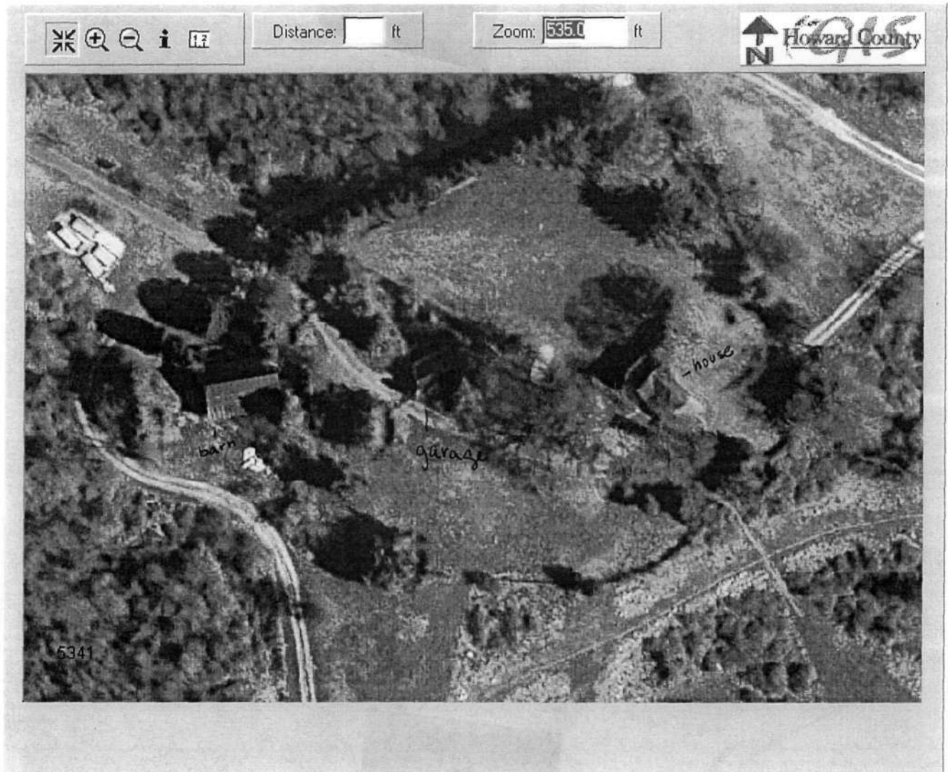
Holste Farm (HO-886) 5341 Kerger Road Ellicott City, Howard County Site plan/Aerial photo