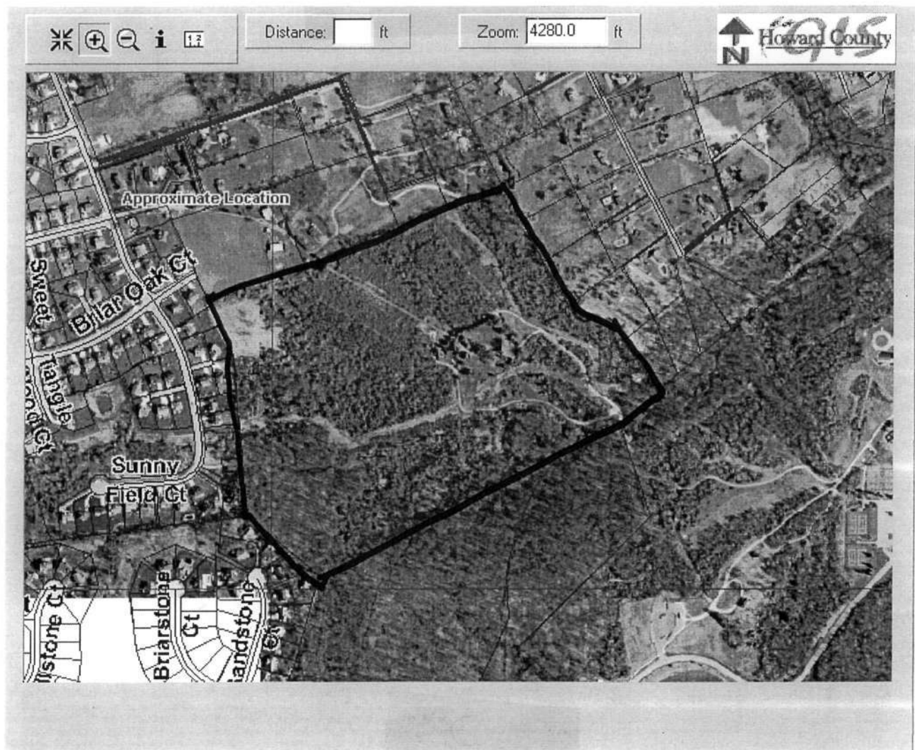
Holste Farm (HO-886) 5341 Kerger Road Ellicott City, Howard County Site plan/Aerial photo