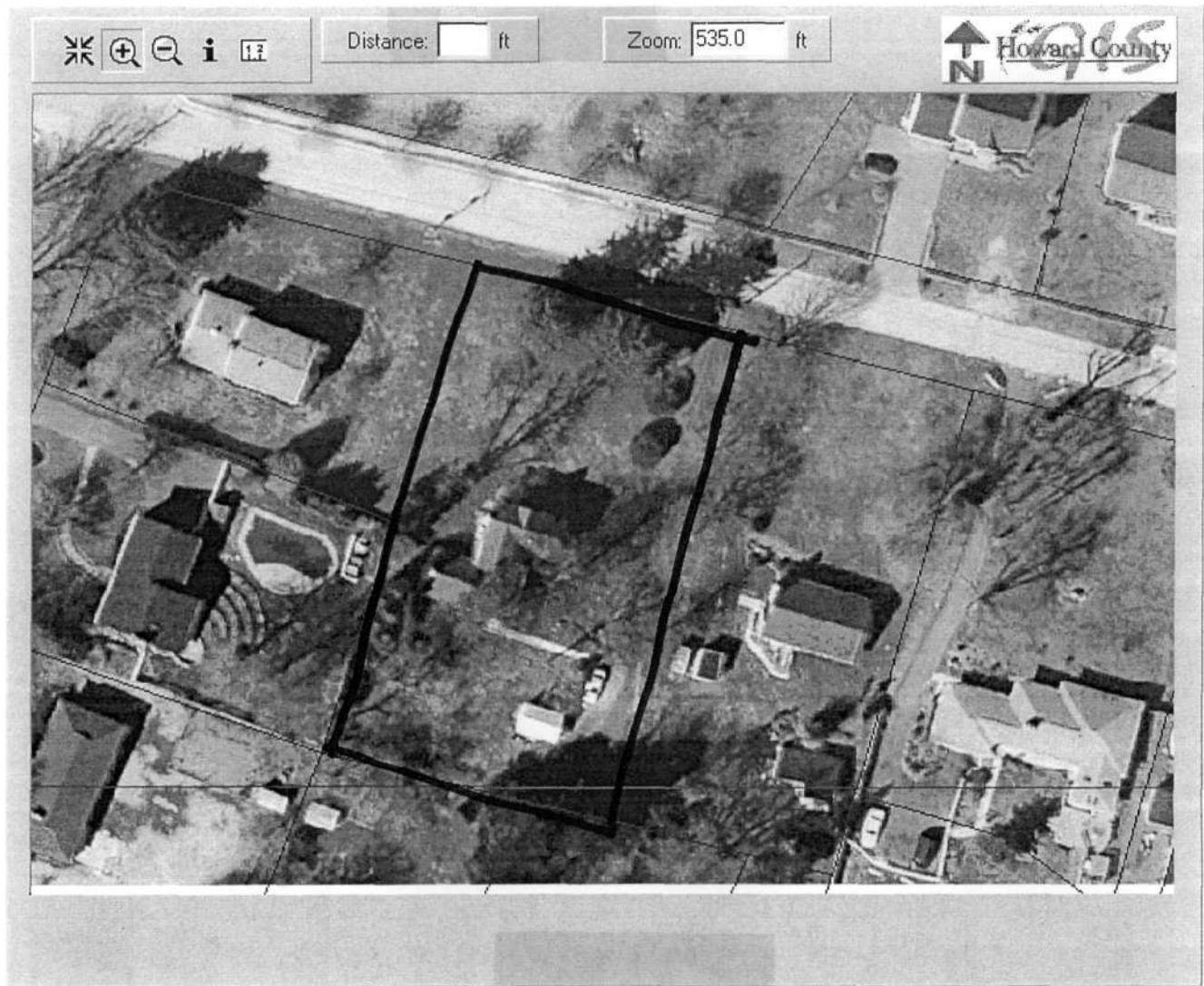
Hanson House (HO-883) 8329 Church Lane Road, Ellicott City, MD Howard County Site plan/Aerial photo