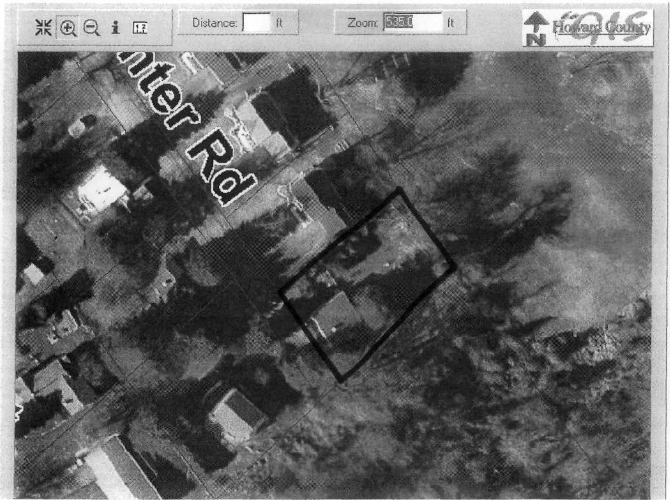
Schatz House (HO-871) 3935 Hunter Street, Ellicott City Howard County Site Plan/Aerial Photo