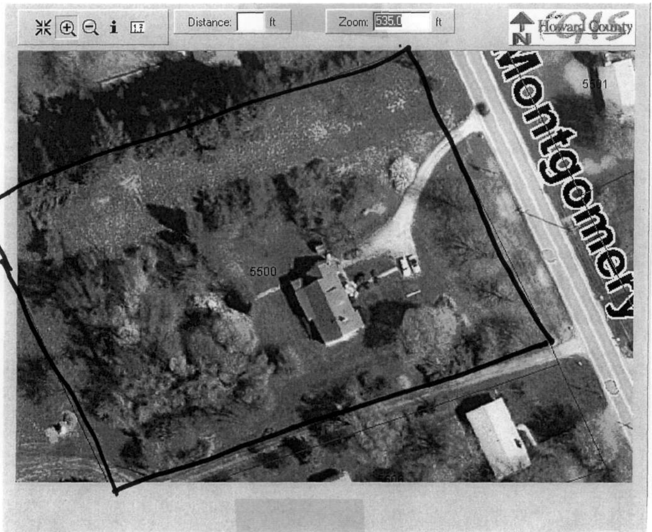
Spence House (HO-863) 5500 Montgomery Road, Ellicott City Howard County Site Plan/Aerial Photo