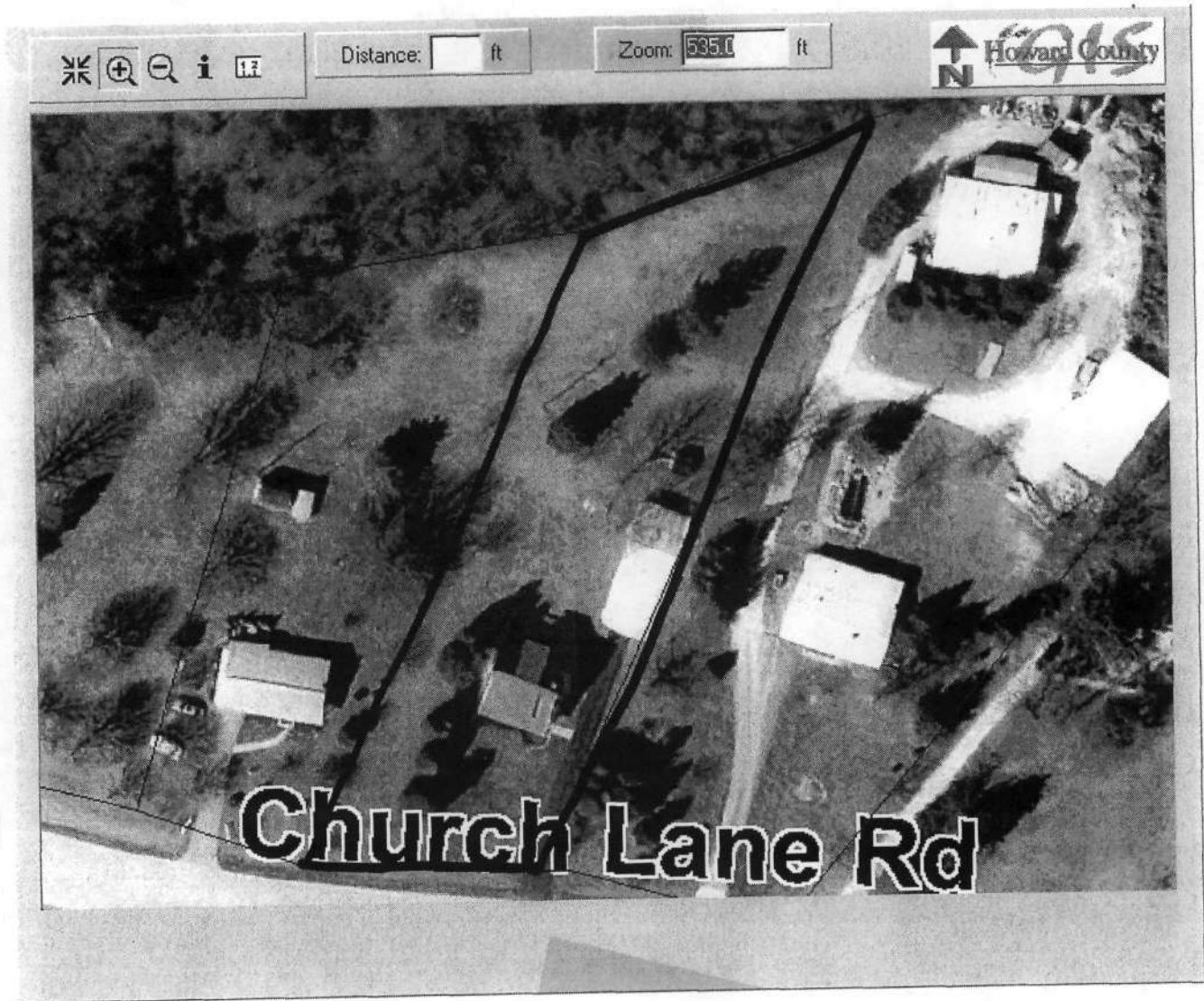
Hessler House (HO-852) 8466 Church Lane Road, Ellicott City, MD Howard County Site Plan/Aerial Photo