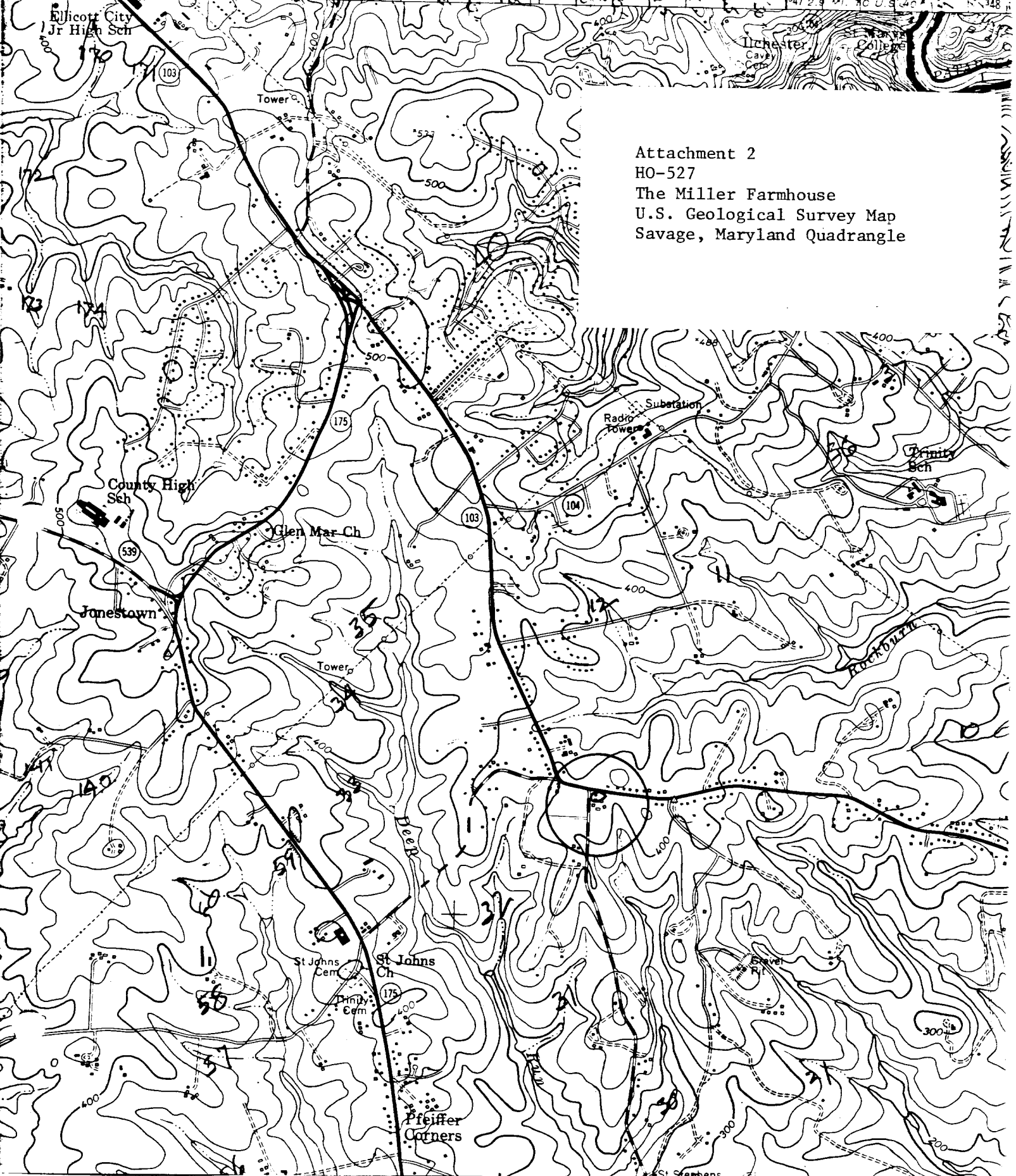
Attachment 2 HO-527 The Miller Farmhouse U.S. Geological Survey Map Savage, Maryland Quadrangle

5002 IV SE 0.6 MI. 78 U.S. 29 ELICOTT CITY 644