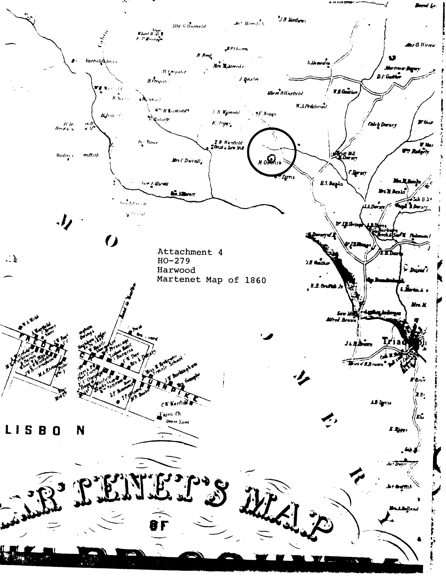
Attachment 4 HO-279 Harwood Martenet Map of 1860