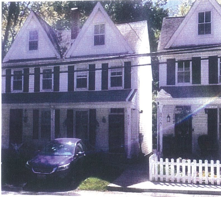
Photo One Caption Front view taken 09/21/2020

If using the Elevation Certificate to obtain NFIP flood insurance, affix at least 2 building photographs below according to the instructions for Item A6. Identify all photographs with date taken; "Front View" and "Rear View"; and, if required, "Right Side View" and "Left Side View." When applicable, photographs must show the foundation with representative examples of the flood openings or vents, as indicated in Section A8. If submitting more photographs than will fit on this page, use the Continuation Page.