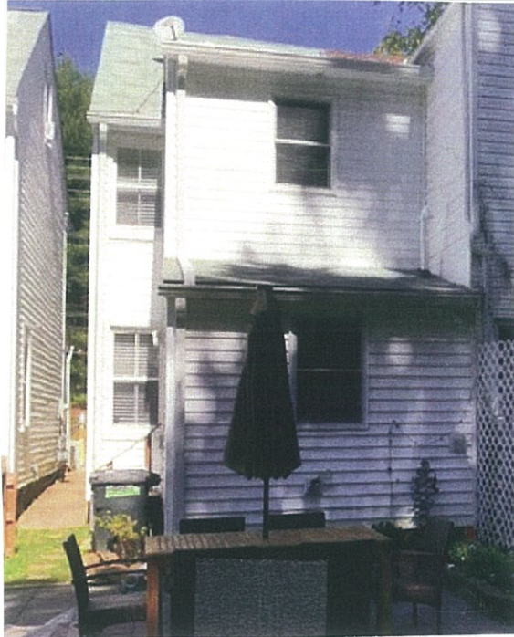
Photo Three Caption Rear view taken 09/21/2020

If submitting more photographs than will fit on the preceding page, affix the additional photographs below. Identify all photographs with: date taken; "Front View" and "Rear View"; and, if required, "Right Side View" and "Left Side View." When applicable, photographs must show the foundation with representative examples of the flood openings or vents, as indicated in Section A8.