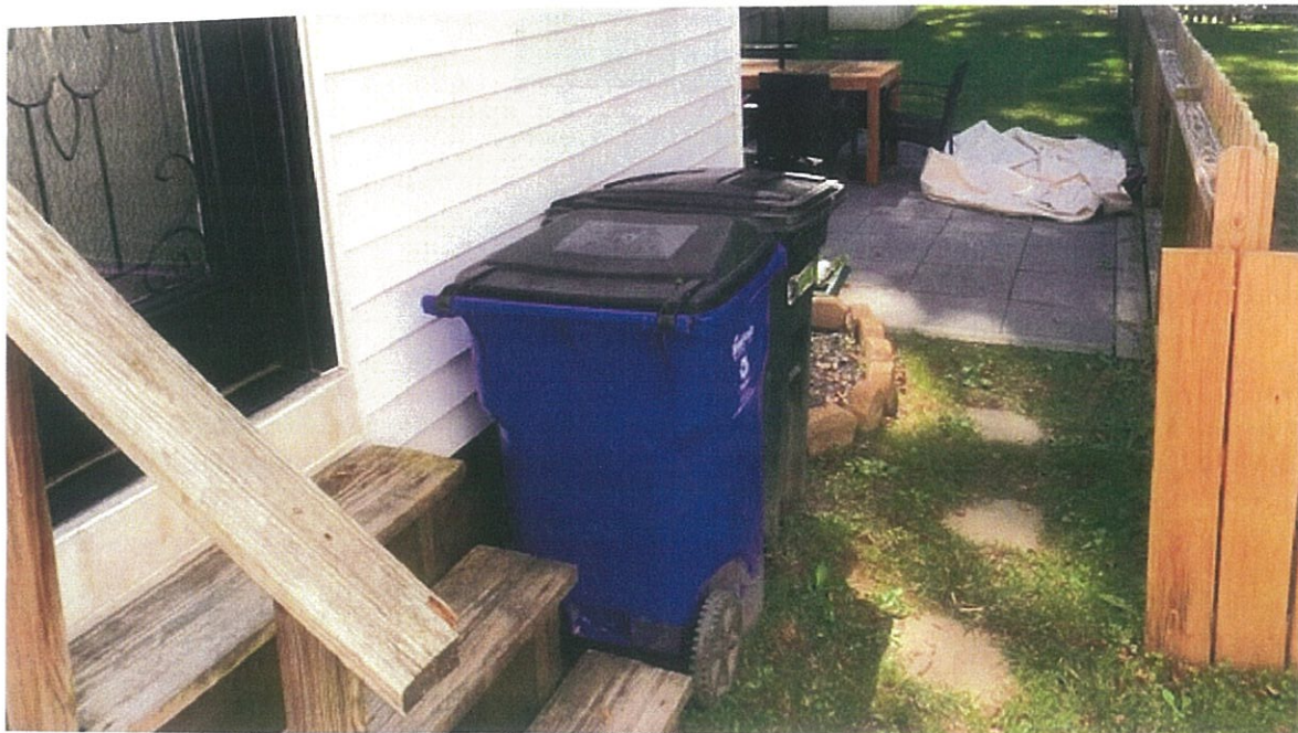
Photo Four Caption Right side view taken 09/21/2020