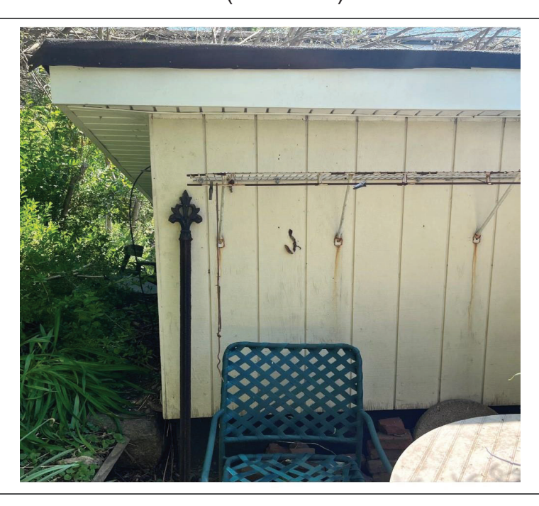
Photo Two Caption: Rear view taken on left side 04/29/2024 (north east side)