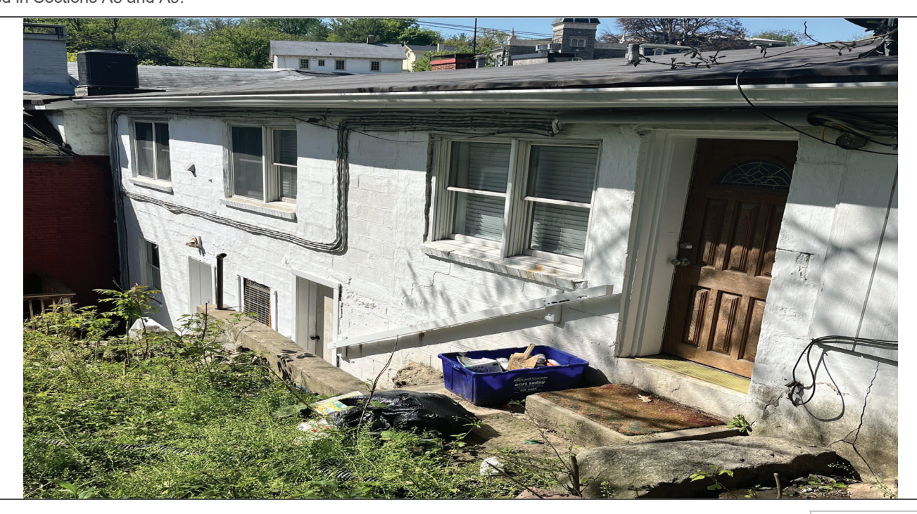
Photo Three Caption: 4th floor entrance 04/29/2024 (north east side of building)

Insert the third and fourth photographs below. Identify all photographs with the date taken and "Front View," "Rear View," "Right Side View," or "Left Side View." When flood openings are present, include at least one close-up photograph of representative flood openings or vents, as indicated in Sections A8 and A9.