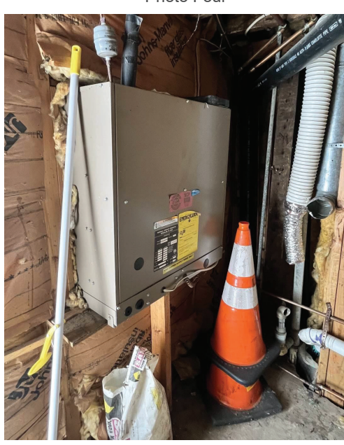
Photo Four Caption: Electric Panel between second and third floor (east side )