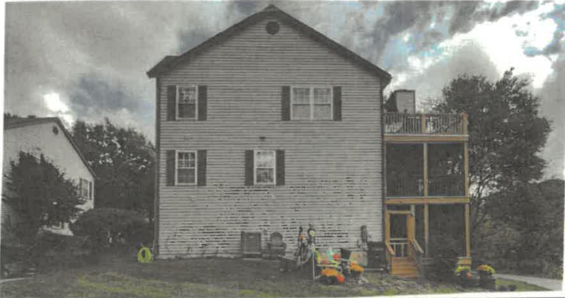
Photo Three Caption: right side view taken 10-05-2023