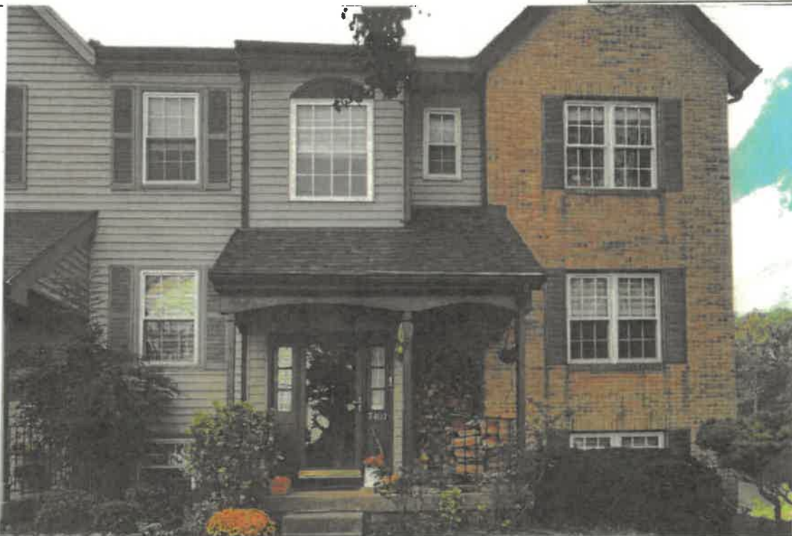
Photo One Caption: front view taken 10-5-2023

Instructions to take front "Right Side" up photo