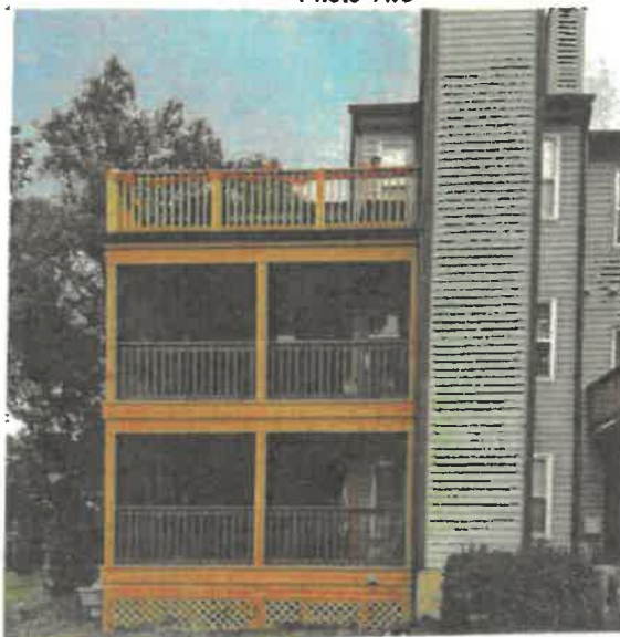
Photo Two Caption: rear view taken 10-5-2023