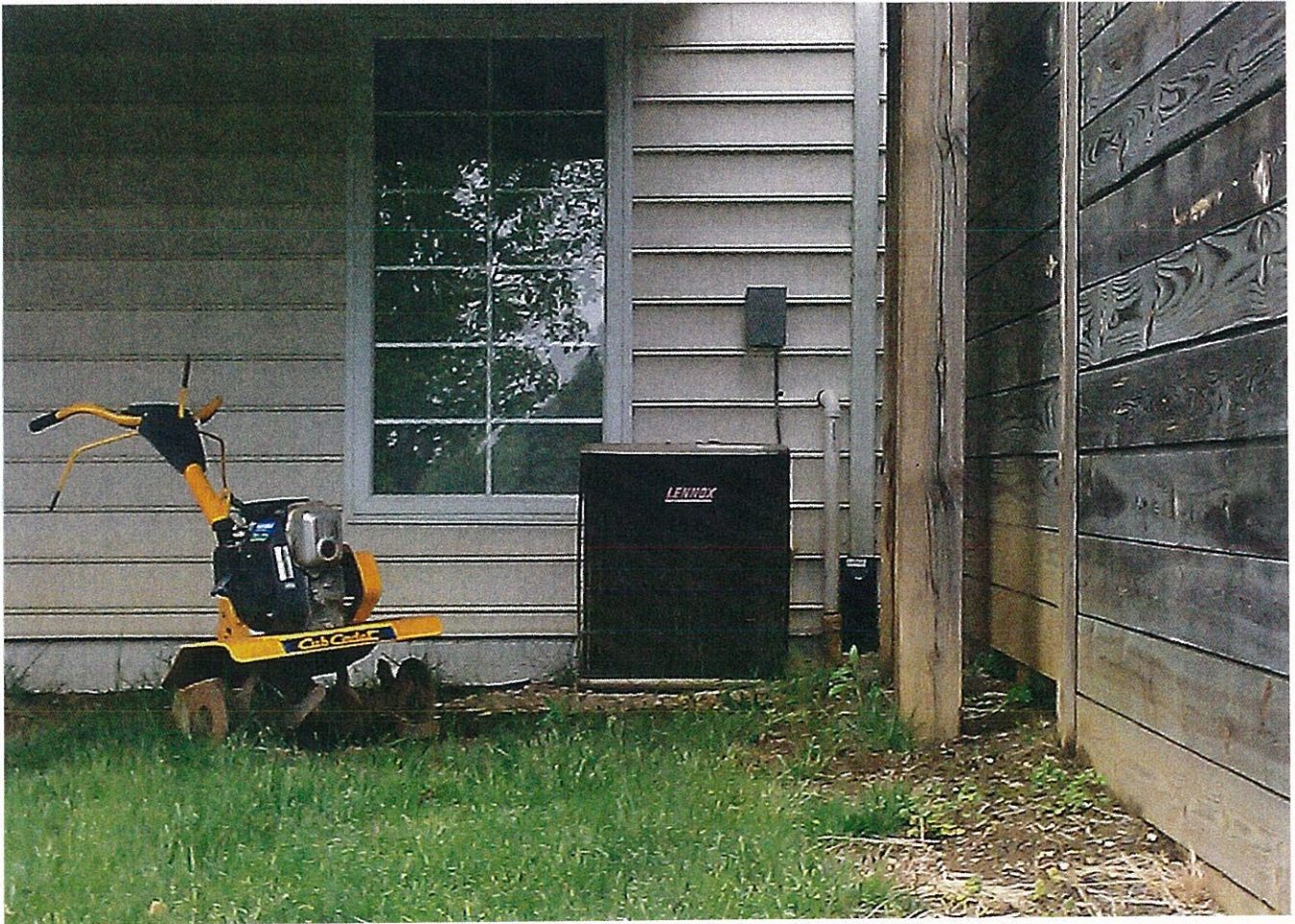
Air conditioning unit