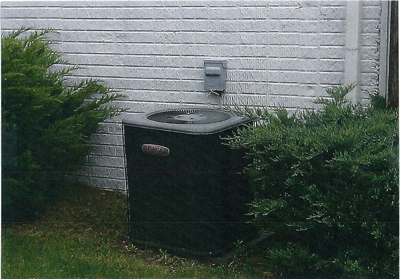
Air conditioning unit