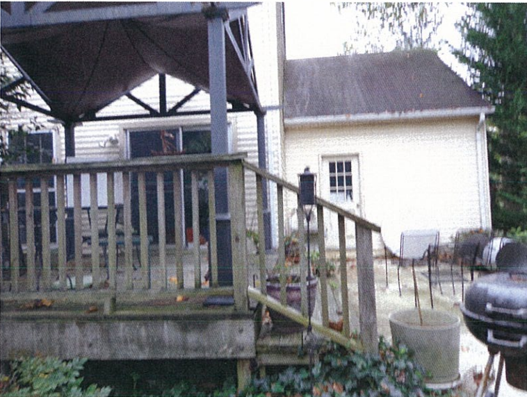
RIGHT REAR VIEW

If submitting more photographs than will fit on the preceding page, affix the additional photographs below. Identify all photographs with: date taken; "Front View" and "Rear View"; and, if required, "Right Side View" and "Left Side View."