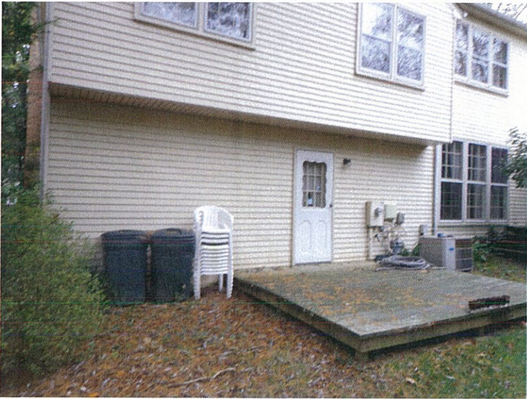
LEFT REAR VIEW