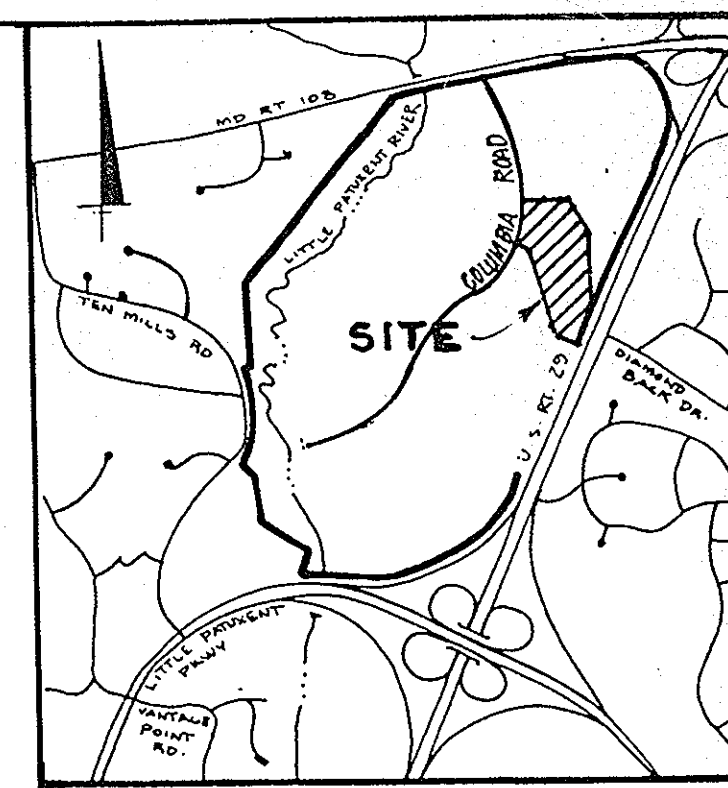
VICINITY MAP SCALE: 1"=2000'

* One on driveway and one in integral garage.